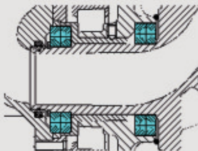
Fully sealed hose connection