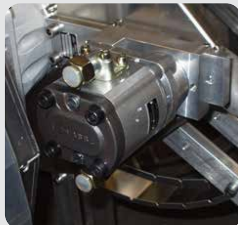
Hydraulic drive MZFS