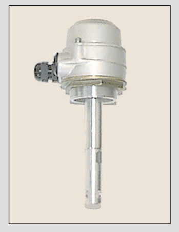
EuroSENS to EN 13922

Overfill Prevention The System requires a gantry controller to European Norm EN 13922 controlling both 2-wire and 5-wire optic sensors. A 10 pin plug connects to the EuroLINK socket installed on the tanker. Each tanker compartment is to be equipped with a EuroSENS or EuroBiSENS.