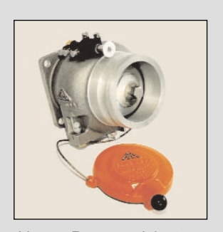
Vapour Recovery Adapter CAMV with interlock

The interlock function may be used also for wet-leg sensor systems which allows loading only when all compartments are empty.