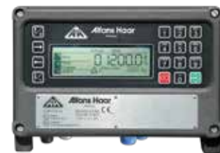
CountMASTER 4A Interactive interface between user and measuring unit